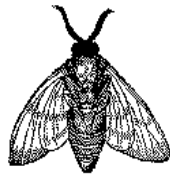
Figure 2: A sample black and white graphic that has been resized with the includegraphics command.